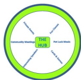
Hackensack Hub

We would also like to give a shout out to another nonprofit: the Initiative Foundation of Central Minnesota .