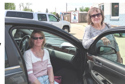
Faith in Action Volunteers

Faith in Action for Cass County connects community volunteers who provide nonmedical, neighborly assistance to seniors, the disabled, and people in need throughout Cass County. With 26.5% of its population aged 65 and better, Cass County sees many people who retire here who don't have nearby family support. Without public transit or even taxi services, people of all ages struggle to get things done if they cannot drive. Many people are on fixed incomes or have mobility problems. Faith in Action volunteers are glad to fill in the gaps in services lacking in our area, even providing an accessible van for people with wheelchairs. In 2019, 123 volunteers assisted 356 people, provided 3,497 rides, contributed 9,800 hours and drove 158,875 miles. They fill about 266 requests each month. We serve people of all ages and have no income restrictions or fees. For more information about Faith in Action community services or volunteer opportunities call 218.675.5435 or email cassfia@uslink.net .