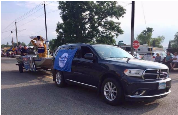
Sweetheart Day Parade