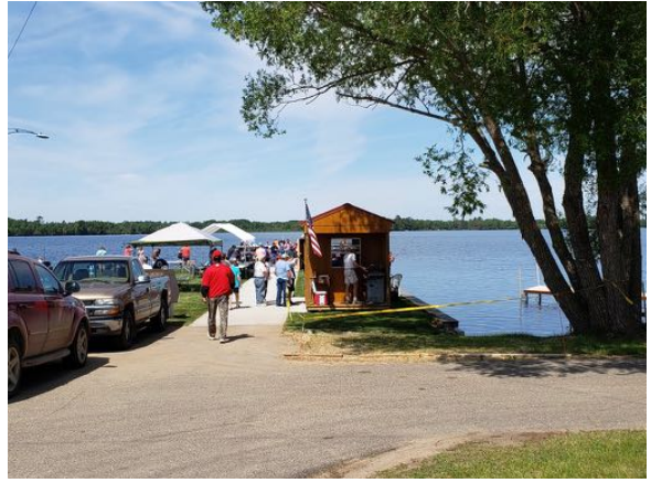
The Birch Lake Association is now an official sponsor of the weekly Children's Fishing Contest.