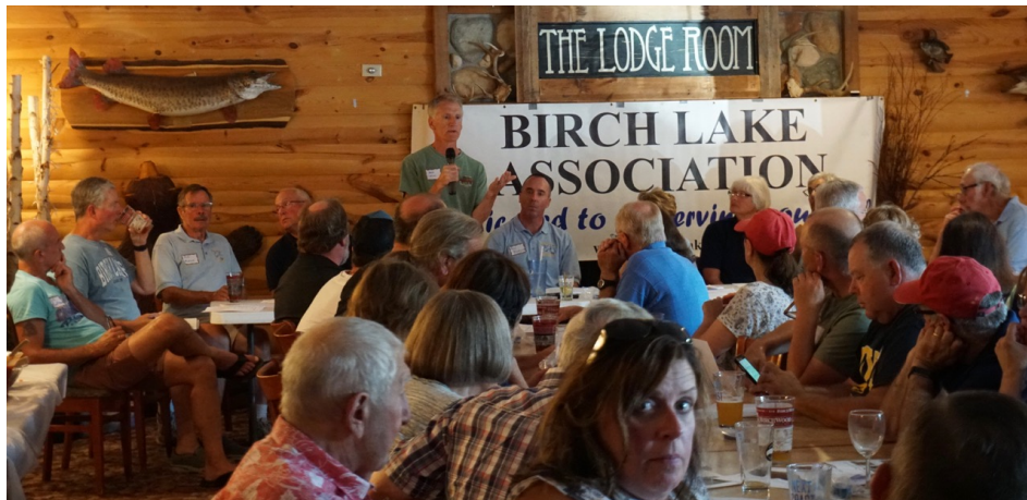
BLA Annual Membership Meeting Thank you to all our fantastic member!