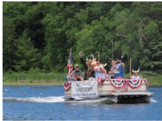
July 4 th Boat Parade