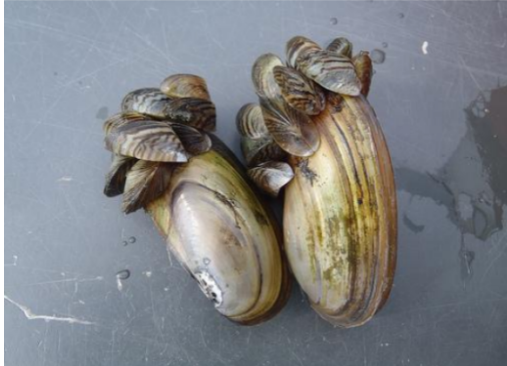
Zebra mussels attach to the shells of native mussels, smothering them.