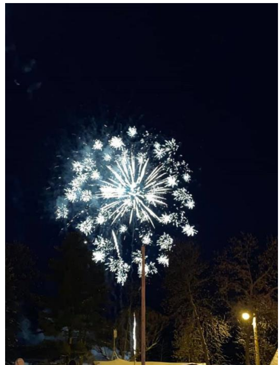
Back to Hack activities 2021