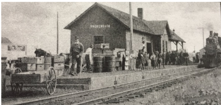
M & I Depot 1925

(To be continued in the next BLA newsletter.)