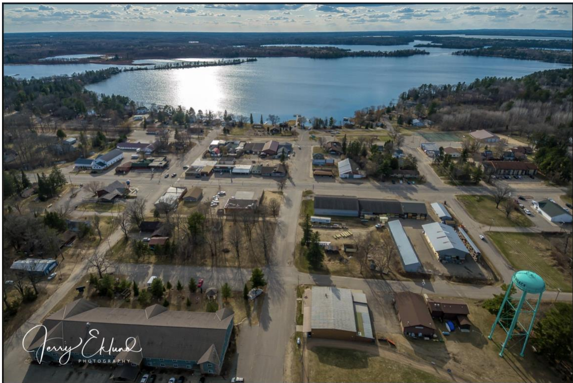
Hackensack and Birch Lake

**Are you receiving a PRINTED copy of this newsletter?? You can save BLA RESOURCES by receiving newsletters via email. Simply send a note to mybirchlake@gmail.com to request an emailed newsletter