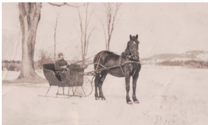
(Random internet picture)